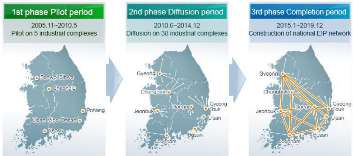
Figure No. (6) shows the three stages of implementing Korea's green industries strategy Source: Green Industry Conference, 2013 "Eco Industrial Park Initiative in Korea"

Efficiency of Governance: It is measured by the efficiency of environmental and economic laws and policies and the rates of technology introduction into manufacturing. In the 1990s, the Korean government began implementing laws to strengthen the environmentally friendly industrial structure (APEFIS), where it focused on promoting cleaner production (CP) and a certification program for environmental management system (EMS) on the basis of ISO14001. Indeed, a long-term plan was developed that succeeded in converting industrial complexes to EIP and introducing new and renewable industries energy to reduce energy consumption in Korea and reduce greenhouse emissions to 30%.