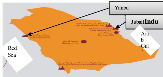
Figure No. (2) The Site of both Cities Jubail & Yanbu in The Kingdom of Saudi Arabia

The effective experiments to implement the industrial localization strategy were selected according to the extent to which they achieve the desired goal of their application. This is measured through the measurement indicators for each strategy, and then the application determinants are extracted for each of them.